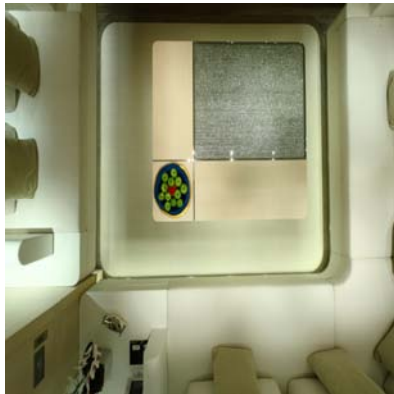
TABLE BY BERNARD PICTET FOR THE ZÉFIRA — ARCHITECT RÉMI TESSIER — PHOTOGRAPHER MARIANNE HASS.