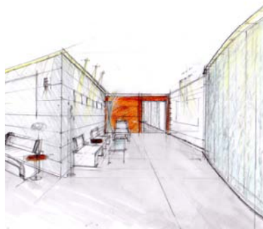
DIXENCE, SKETCH BY MICHAELA LAZARIOU FOR THE BOARDROOM WALL © MICHAELA LAZARIOU

This composition brings a translucent quality that lets in borrowed light, creates a surprising impression of depth, and allows for differing degrees of opacity and luminosity.