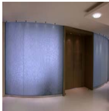
DIXENCE, BOARDROOM WALL © ATELIER BERNARD PICTET