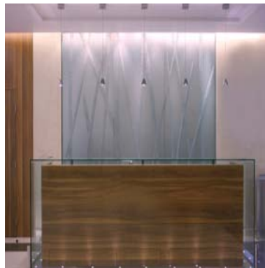
DIXENCE, RECEPTION DESK

A supple composition of bamboo stalks in chiselled and acid-etched silvered glass adds subtle interest to the wall behind the reception desk.