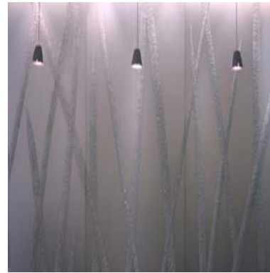
DIXENCE, RECEPTION DESK © ATELIER BERNARD PICTET

In the boardroom, the need for a high level of soundproofing required the use of three thicknesses of glass.