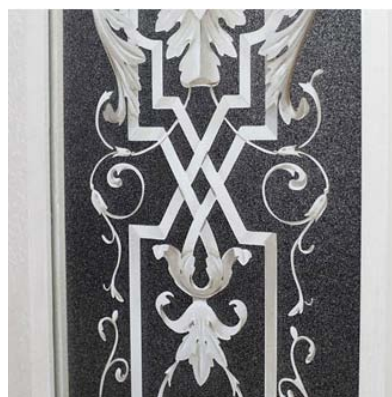
DETAIL FROM THE PAINTED MIRROR