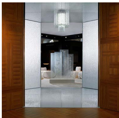
VIEW OF THE HALLWAY

This hallway was the showcase for Bernard Pictet, who imagined a chandelier, ceiling, pillars and floor in extra-white glass which was chiselled and engraved to create a cascading water effect.