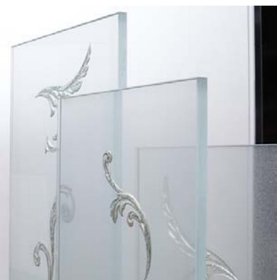
DETAIL FROM THE SCREEN