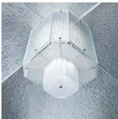
CEILING AND CHANDELIER