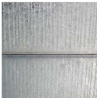
PILLAR BASE AND FLOOR

Bernard Pictet also created a screen in extra-white laminated glass which was frosted to produce a subtle translucent effect. Engraved scroll embellishments were gilded in white gold and pale gold.