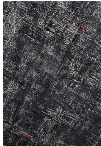
detail on the lacquer side