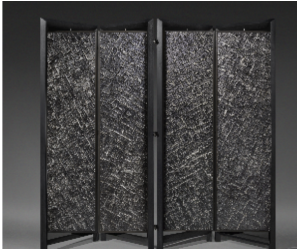
Screen, overview © Jacques Pépion

The Atelier, create in collaboration with cabinet-maker Ludwig Vogelgesang, a folding screen whose double-sided panels were created with lacquer artist Mireille Herbst; the frame is by Ludwig Vogelgesang.