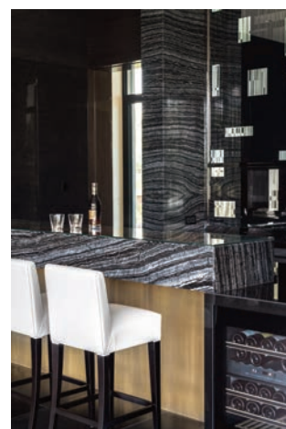
VIS A VIS