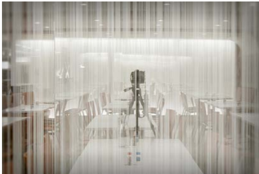
6/8 HAUSSMANN – THE REFLECTED CAMERA SHOWS THE EXCEPTIONAL REFLECTIVE QUALITY OF THE GLASS 16K ARCHITECTES