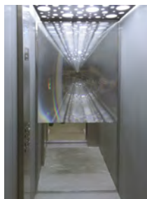
© ATELIER BERNARD PICTET OPTICAL GLASS INSIDE A PRIVATE LIFT